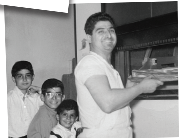
Papa & His Boys - Palermo Villa Restaurant circa 1967