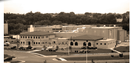
Villa Palermo 2006