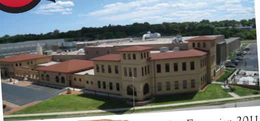
New Expansion 2011