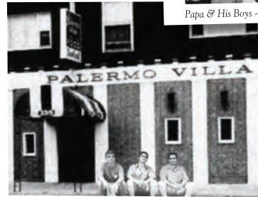
Palermo Villa Restaurant circa 1974