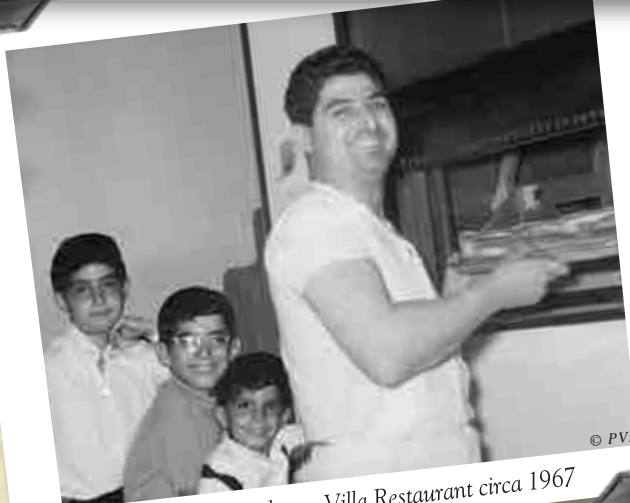
Papa & His Boys - Palermo Villa Restaurant circa 1967