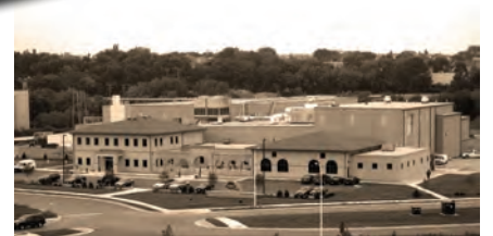
Villa Palermo 2006