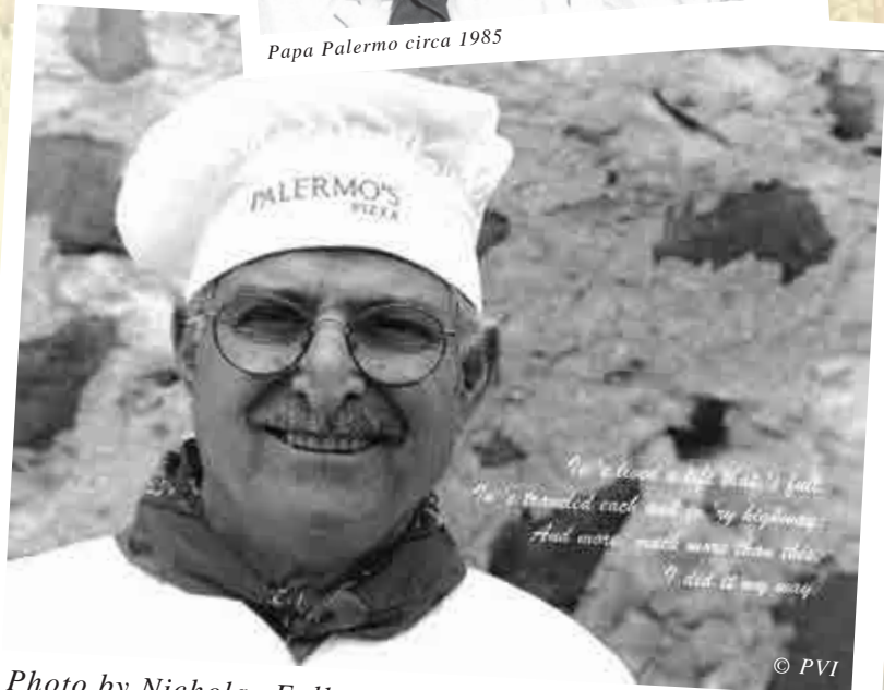
circa 2005