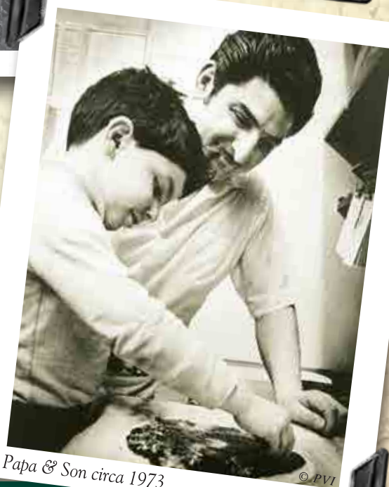
Papa & Son circa 1973

Access downloadable logos and images related to Palermo's 55th Anniversary