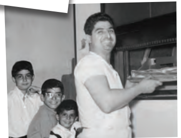
Papa & His Boys - Palermo Villa Restaurant circa 1967