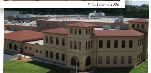
New Expansion 2011