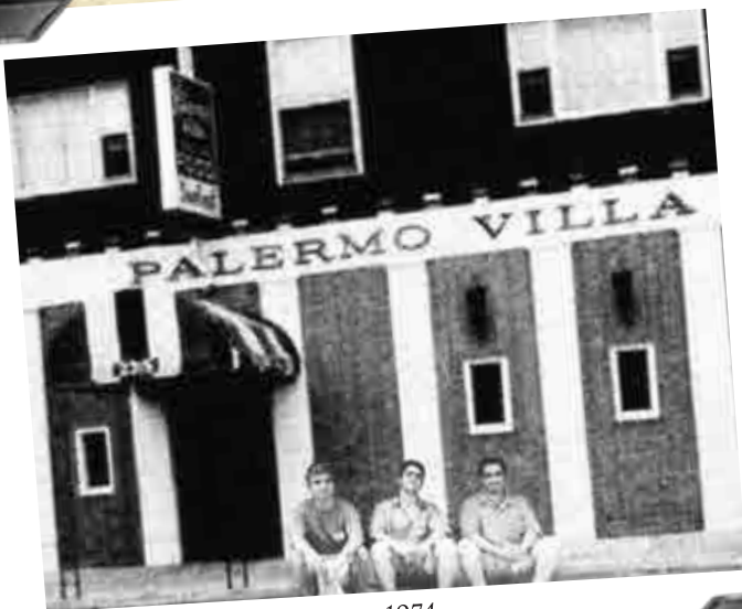
Palermo Villa Restaurant circa 1974