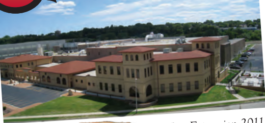
New Expansion 2011